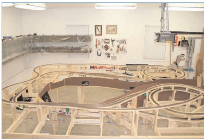
A mechanically complete layout, ready for owner-installed scenery and structures.