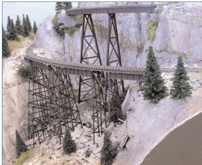
A section of a complete fully scenicked layout, including two scratch-built trestles.